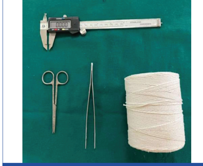
[Table/Fig-1]: Instruments used for measuring GCV.