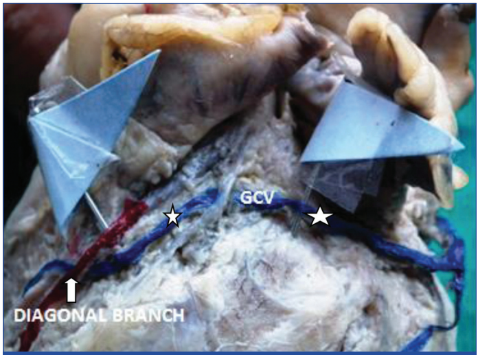
[Table/Fig-4]: Great Cardiac Vein (GCV) (white star) superficially crossed by diagonal branches (white arrow) of left coronary artery.

the hearts GCV start from anterior interventricular sulcus. Majority of GCV were straight but in 1(3.33%) heart GCV showed kinkings. The diagonal branches of left coronary artery were superficially crossed by GCV in 1(3.33%) heart [Table/Fig-4]. GCV was on left-side of anterior interventricular artery in 1 (3.33%) heart [Table/Fig-5].