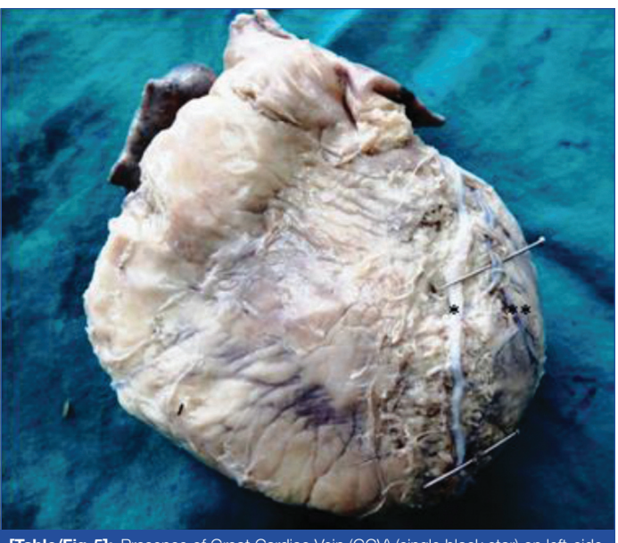
[Table/Fig-5]: Presence of Great Cardiac Vein (GCV) (single black star) on left-side of anterior interventricular artery (two black star) on sternocostal surface of heart.

The present study also revealed that Vieussens valve was present in 23 (76.66%) GCV. The mean length of GCV was 79.26±22.78 mm and the range of length was from 55.50\pm27.57 to 112.33\pm36.07 mm. The mean diameter of GCV was 2.85\pm1.32 mm and its range was from 0.8\pm0.41 to 4.2\pm1.16 mm. The statistical analysis also depicted the diameter of GCV is having significant variation in relation age of cadaver (r=0.376 and p=0.0403) [Table/Fig-6].